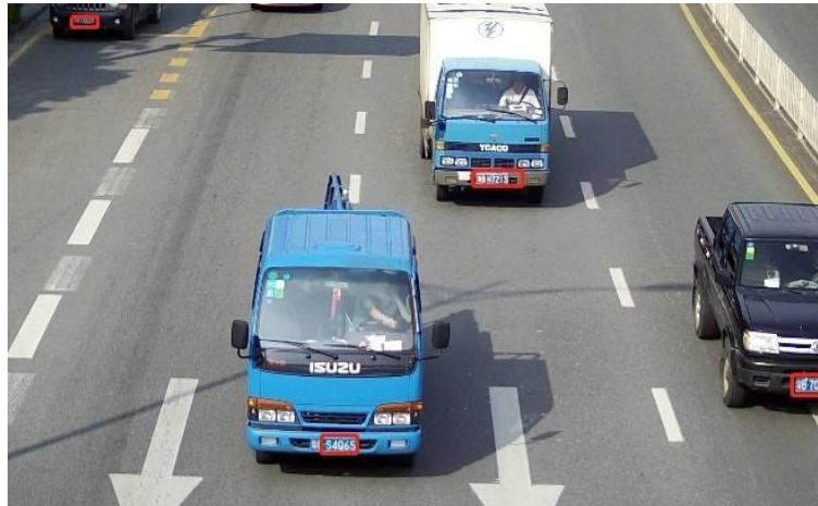
Fig 4. H3 recognition results under fitness

It can be seen from the recognition result that the recognition accuracy of Fig. 2 is not high, and the target area cannot be accurately captured. The recognition result in Fig. 3 is good, and all the target areas in the image can be captured, and the target area in Fig. 4 identifies the defect. The overall correct rate in the comprehensive classification experiment, when the fitness in this experiment is Fitness (h2)=0.9456, the performance of the recognition image is better. From the observation of recognition rate, we can find that the recognition rate of neural network based on genetic algorithm training is better than that based on traditional method training. In addition, the traditional KNN classification method also shows good results. Although the recognition time increases with the increase of the number of training samples, it has good simplicity and anti-interference. In non-real-time analysis environment, the cross- use of multiple methods can be considered to further improve the recognition rate.