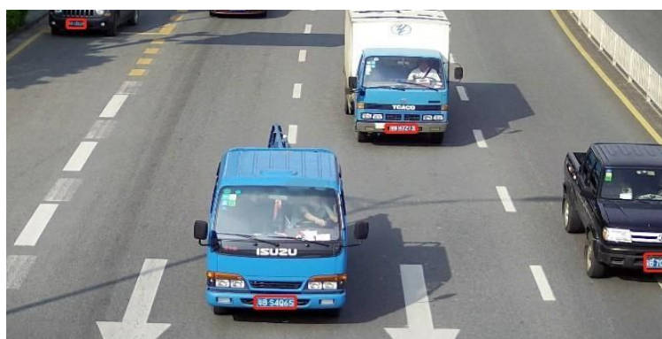
Fig 3.H2 recognition results under fitness