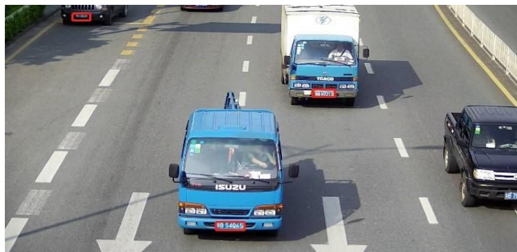
Fig 2. H1 recognition results under fitness

After initializing the network with chromosome h, the percentage of in correct Among the three hypotheses selected, H1, which performs best in training set, does not perform best in test set. The results show that genetic algorithm cannot completely solve the over fitting problem of neural network. In the classification experiment, the overall accuracy is high. Due to the problems of character offset, deformation, skew and blur in the acquired image, any text features have spatial distribution. In the case of noise interference, it is difficult to accurately classify with a few simple features. The license plate recognition results show some differences with different degrees of adaptation, 2,3,4.